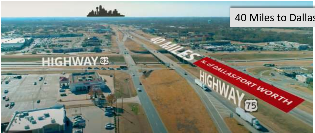
Close to Everything